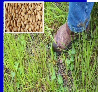
Winter Wheat & Clover