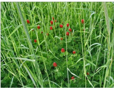
Cover Crop Mix

Cover crop mixes provide multiple benefits over single species plantings. They have been found to have a synergistic effect on each other. For example, when oilseed radish and Austrian winter pea are planted together, the radish growth is much improved by the added nitrogen provided by the pea. The radish provides a support system for the pea to grow on. The pea will also produce more nitrogen when planted with the radish than if grown alone, due to the radish taking up the nitrogen. It is generally recommended to plant three species in combination and include a brassica, such as radish or turnip, a legume for added nitrogen, and a grass, such as cereal rye or annual ryegrass. If you are just starting out with cover crops, it may be in your best interest to begin with a single species, or plant a cover crop mix that winter kills for easier management. The list of mixes is almost endless, but we have included some of the more popular mixes that are cost effective and overall easier to manage.