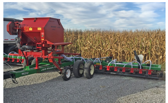
Valmar Cover Crop Seeder