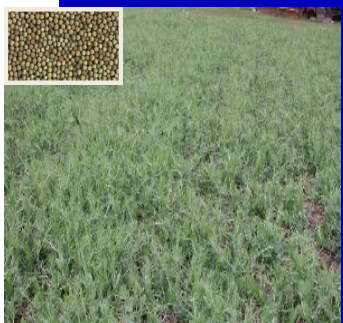
Austrian Winter Pea