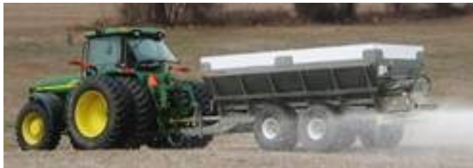
Broadcast seed with fertilizer