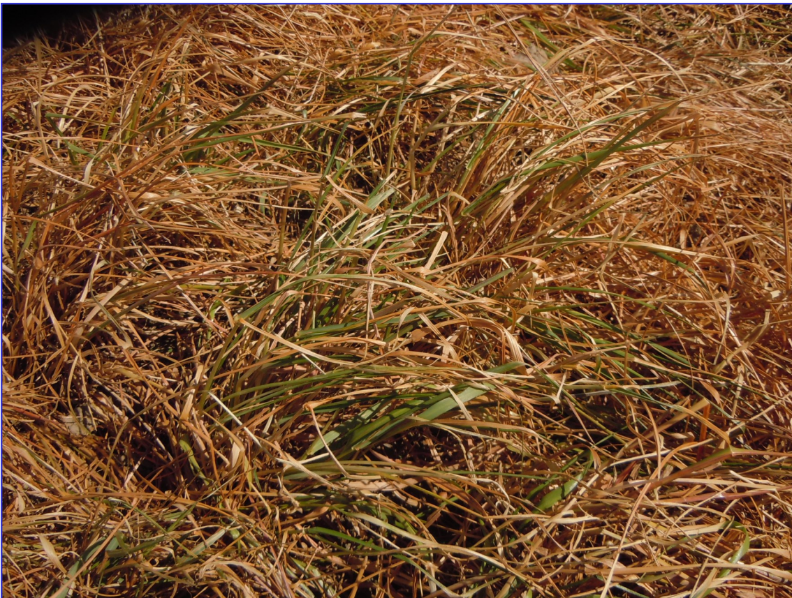
Photo shows annual ryegrass after 1 burn down—green leaf indicates plant is not entirely terminated; growers should plan to burn down twice.

Annual Rye reference: http://www.agprofessional.com/news/Killing-cover-crop-