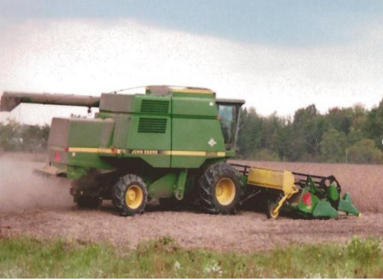
Combine with cover crop broadcast seeder attachment: Low cost to build, no need to make extra passes on your field, save time, and only added expense is cover crop seed.